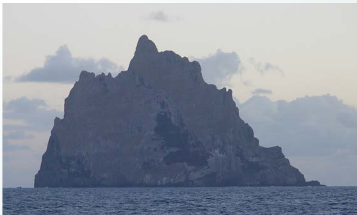
Ball's Pyramid between Australia and New Zealand.

advancing their theory. As Jeff puts it, it's difficult to pinpoint experimental evidence for evolution since we usually think of evolution on massive timescales. As a result, claims are often made for selective pressures without undergoing any real testing. Since we can't simply throw our hands in the air, calling an end to the quest to better understand evolution, we find systems that grow fast enough so that we can directly observe such systems changing before our eyes. For example, bacteria such as E. coli and fungi grow quickly, allowing us to observe the equivalent of thousands of years of human evolution, and devise selective pressures to tease a population into evolving a certain way. The method allows us to ask questions such as: How does a population adapt to a particular stress? Does it reach a steady state in which it is as adapted as it can possibly be, or do organisms keep getting better and more refined forever? In fact, Jeff argues, there are instances in nature where simple organisms develop from complex ancestors. This is apparent in microscopic symbionts living in our gut that have lost the ability their ancestors had to metabolize certain nutrients, and instead rely on their hosts for nourishment.